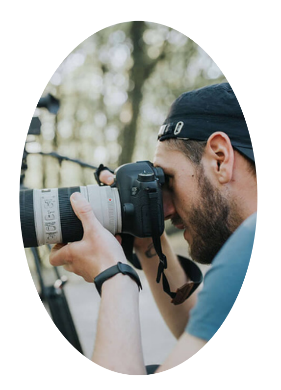
Second Shooter FLAT RATE $400