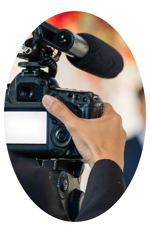
Full Ceremony Vovs $400